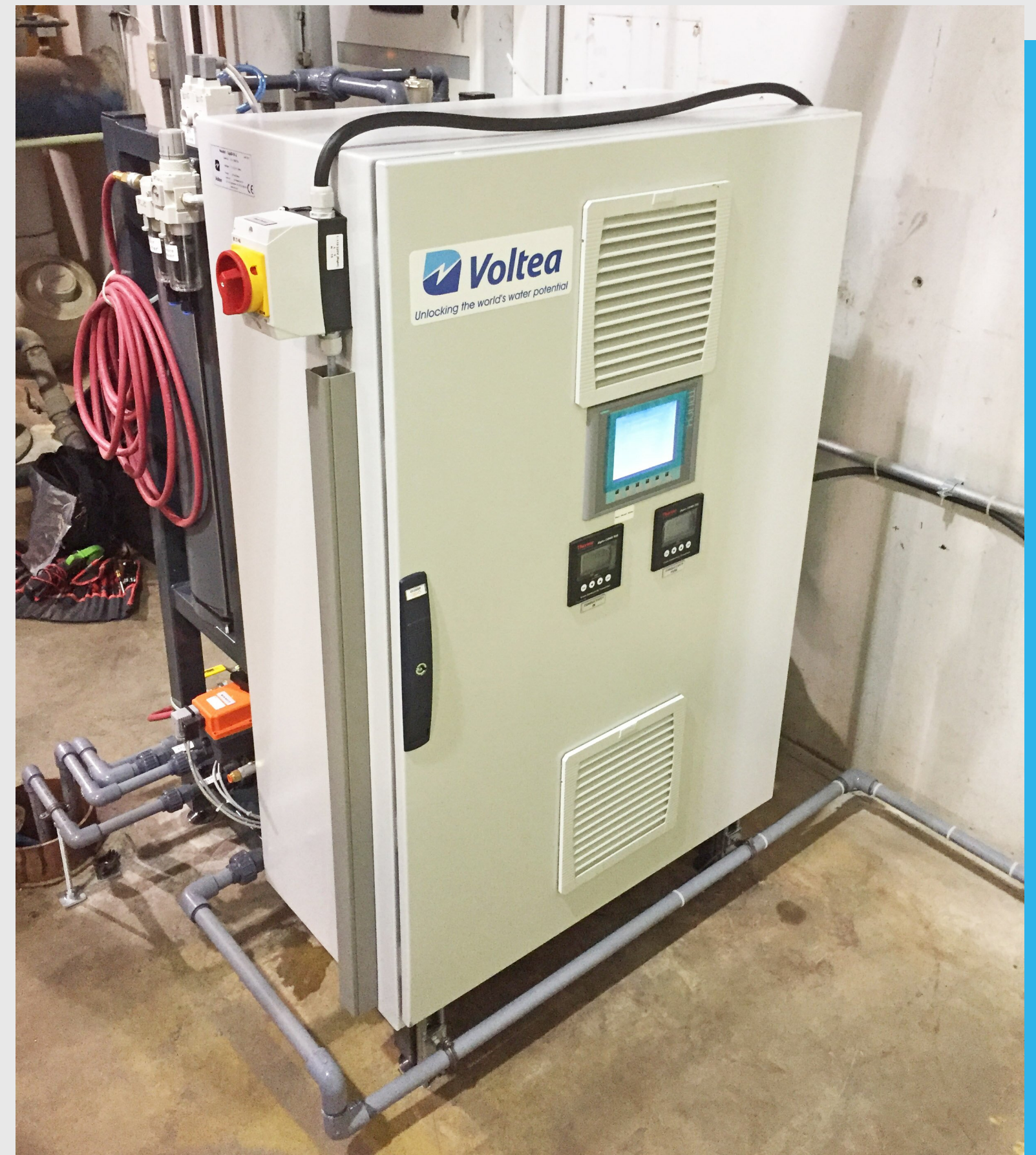
Voltea's Industrial Series 2 (IS-2) CapDI System on-site at Kalida Manufacturing

What sets Voltea's technology apart from other traditional water treatment technologies is its ability to tunably remove electrical conductivity. The system can be adjusted to select the desired level of EC removal in order to ensure a consistent quality output. Real-time monitoring and control capability also significantly reduces the need for maintenance. The technology can simply be turned on or off to produce high-quality water as needed.